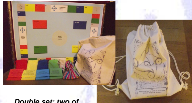
Double set: two of everything in one duffle bag

Each kit includes a canvas 'board'; four packs of cards; 6 counters; a dice; an instruction sheet; a bag of beans (social capital credits) and a duffle bag to keep everything together.