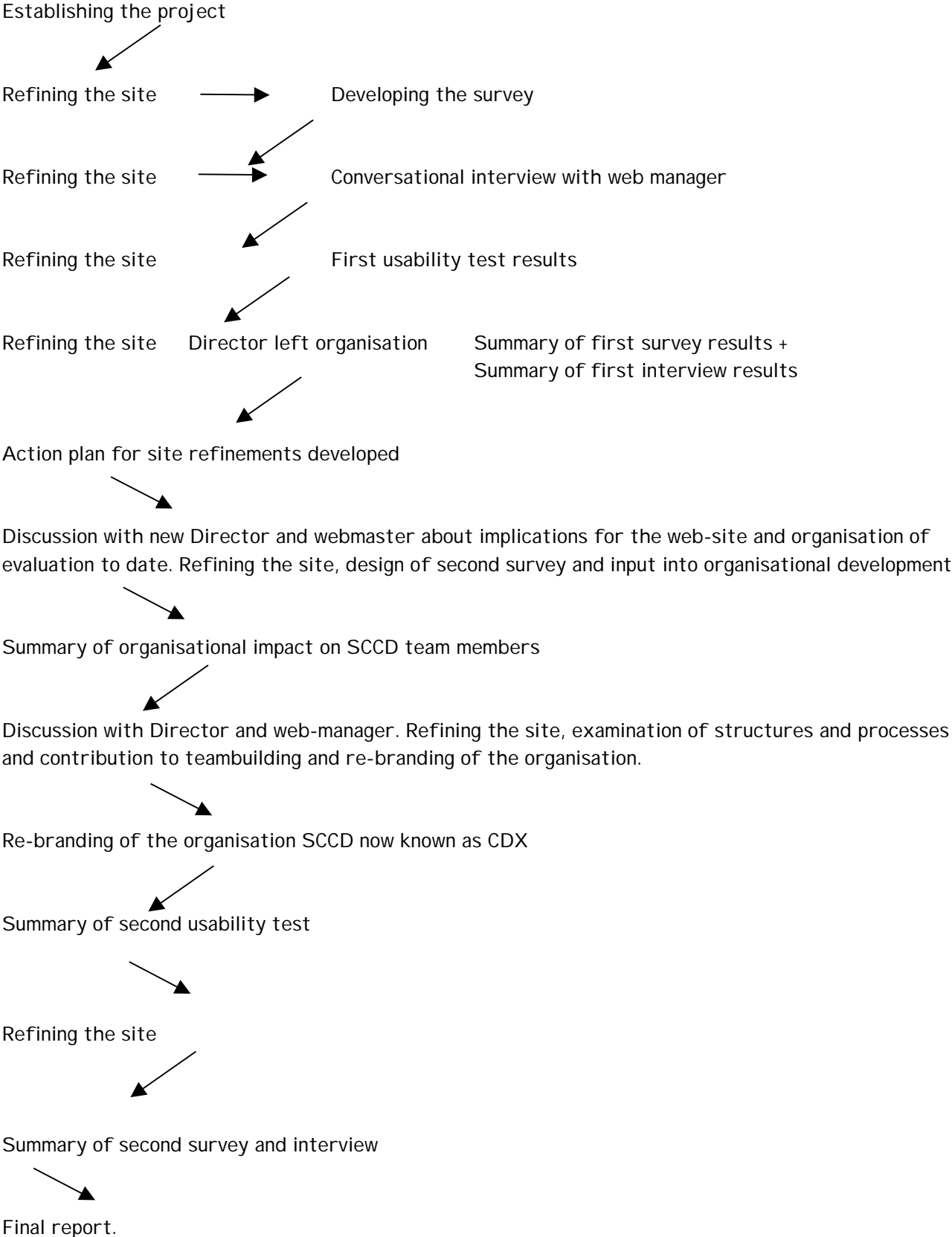
Figure 2: Cycles of response to issues arising from the evaluation